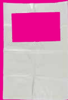
LBSF500 U.S. Patent No. 9,957,105

SecureFit360® poly liner bags are custom designed with a unique strap that wraps around the bottom of the receptacle to secure in place and enclose waste for fast, easy and safe removal. Strap keeps the bag tight fitting so it doesn't collapse inside the receptacle.